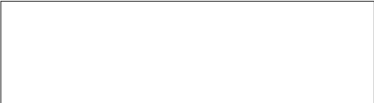
Tabawa is surfing on her broom

But she can't swim in the sea. She can't dance, she can't ride a horse. And she can't garden because she is afraid of bees!!!